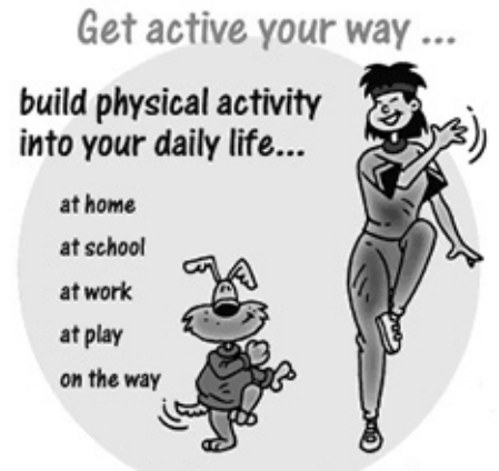
.... that's active living!

Foundations of Exercise Science: studying human movement and health: cost $60